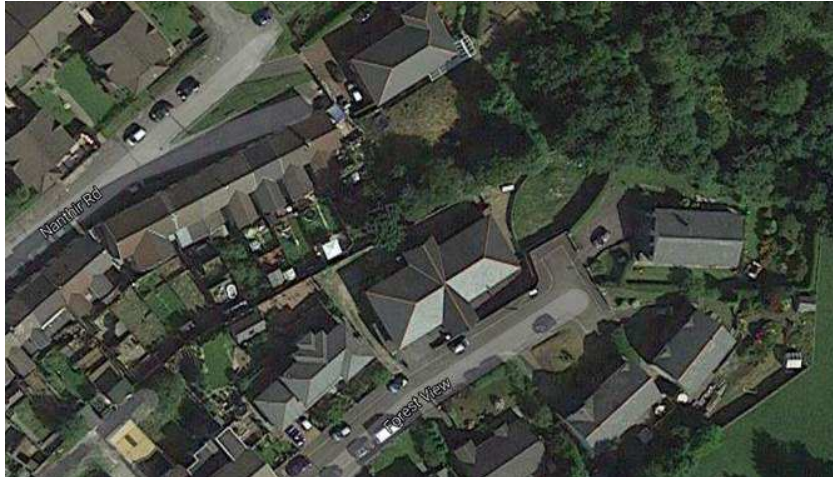
Fig. 2: Aerial Photograph

With regard to the concern raised by the occupier of 40 Nanthir Road which relates to noise, overlooking and loss of privacy, it is considered that the proposed conversion of the disused basement area into one flat and one bedsit will not impact the existing levels of privacy or amenity of neighbouring properties, given its position, distance from habitable room windows (minimum of 22m), difference in levels and the existence of boundary treatments. No concerns are raised which relate to neighbour amenity.