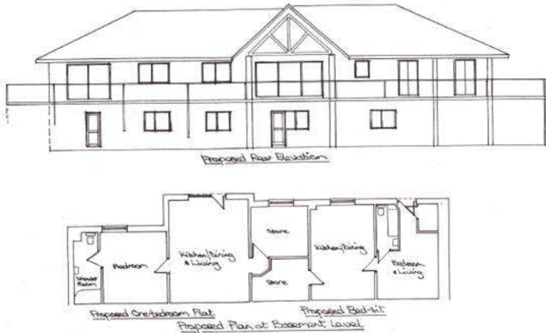
Fig. 1: Proposed Basement Floorplan and Rear Elevation

The only external modifications proposed comprise the alteration of the window and door openings at basement level at the rear of the existing dwellinghouse. The alterations are considered to be inconsequential, as they will not significantly alter the visual appearance of the property from the street scene or detract from the overall character and appearance of the building.